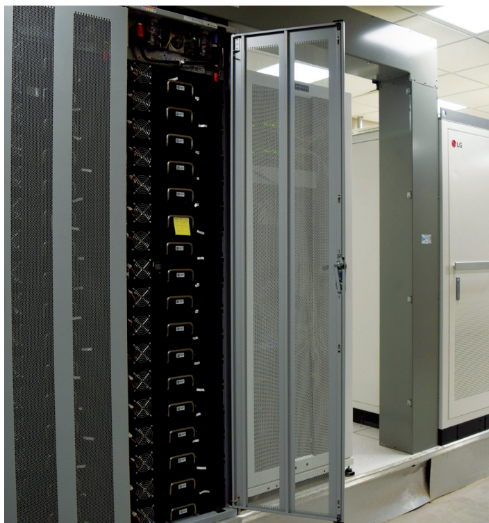
The LG Energy Storage System (ESS) in the Sinclair Hotel basement is now the first lithium-ion battery system in the world to be used as a replacement for the required backup diesel generator. It's also UL 924 rated and provides peak load shaving in the building.

By masterfully combining Art Deco architectural beauty with future-forward technologies and sustainable cable, Sinclair Holdings and partners have renovated and revitalized a 1930s-era historic landmark in Fort Worth, into an unprecedented Sustainable Intelligent Building – one that provides immense energy efficiency, savings on both construction time and cost and an unrivaled hospitality experience – all run on DC power and Superior Essex Power-over-Ethernet (PoE) cable. //