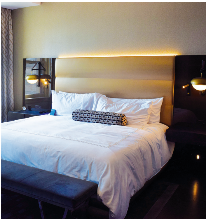
A single Superior Essex 18 gauge/8 conductor PoE cable powers the bed headboards, each of which features seven lights.