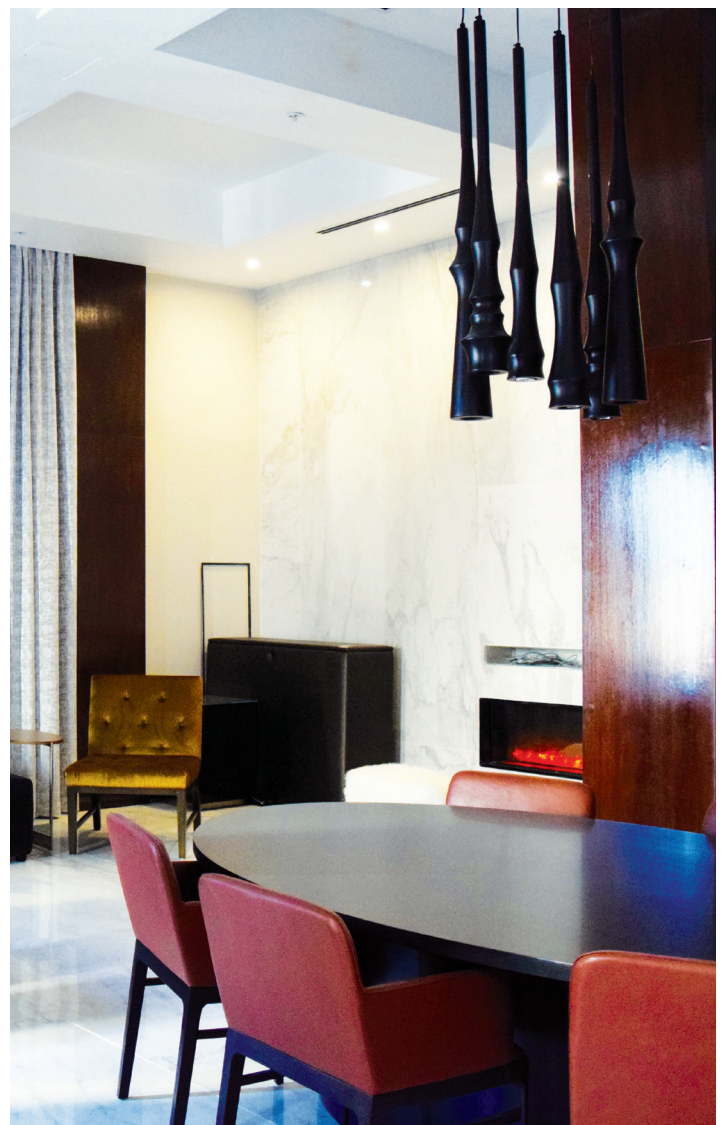
By working with innovative partners, The Sinclair Hotel features stunning PoE lighting fixtures, such as the ones shown here, more than half of which had never been powered by PoE technology before.