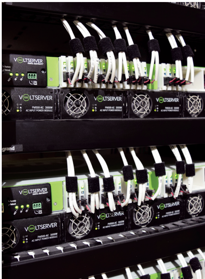
The building’s VoltServer DC power distribution system sends packets of smart “digital electricity” throughout the hotel via over 286,000 feet of Superior Essex PoE cable.

Utilizing 22 AWG copper conductors, PowerWise 1G 4PPoE cable delivers 60 Watts of power to PoE-enabled devices with 97% power efficiency and 100 Watts of power at 88% power efficiency, while also supporting 1 Gigabit data transmission. In spaces with hundreds of PoE devices, this greatly improved power efficiency can yield an energy savings of thousands of kilowatt hours per year, which translates to thousands of dollars in saved utility costs. Additionally, PowerWise 1G 4PPoE cable maintains the lowest temperature rise in large cable bundles, ensuring reliable power and data transmission in high-density installations and further improving system energy efficiency.