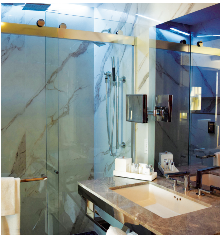
The hotel suites, with their gorgeous amenities and fixtures, utilize PoE cable to power, connect and control more than 30 devices in each room, including the bathroom lights, electric mirror and even the shower head.