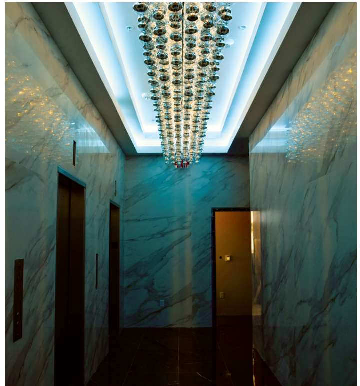
Though the renovation was a retrofit and somewhat constrained by the building being listed on the National Historic Register, the simple elegance of PoE systems allowed the in-house designer to create a unique, energy-efficient ambiance both in this elevator bank and throughout the rest of the hotel.