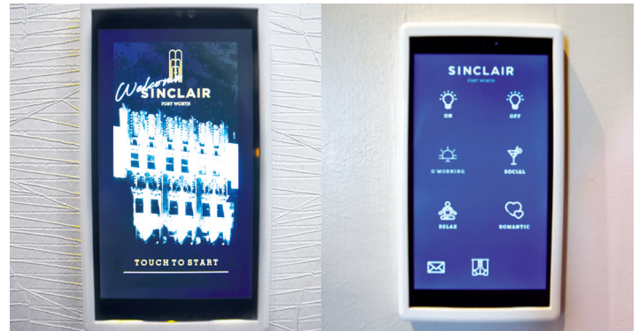
Hyper-efficient PowerWise 1G 4PPoE cable powers the touchscreen wall controllers that are located over 35-60 ft. away from the nearest devices they control.

In 2018, Sinclair Holdings opened a CVS store in their office building next door with similar technology, making it the first CVS in the world to run on low-voltage DC lighting and Digital Electricity.