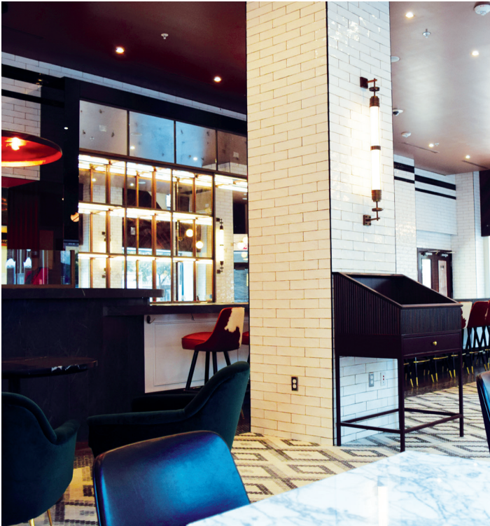
There are over 5,000 lights installed throughout the hotel, as seen here in the hotel restaurant and lobby bar, each powered and connected to the network with PoE cable.

“The cabling from Superior Essex has actually been ahead of what we’ve been able to accomplish so far in this project. They always had a solution, and then they guided us on what that best solution would be – stuff we didn’t even know we could do. They were able to provide us with a variety of cables to meet our different needs, and then supplied them in a timely manner. They have all of the ends and odds of what you’ll need to make a digital building, and having a partner that’s willing to help you, and that’s quick and responsive, has been so helpful time and time again”